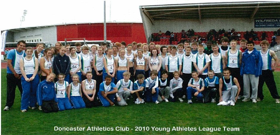
Doncaster Athletics Club - 2010 Young Athletes League Team

It was with a degree of trepidation that we went into the 2010 McCain's Young Athletes League competition. On the back of a season, where the team of 2009 surpassed all expectations by finishing fifth overall in the North, it was always going to be difficult to live up to this, especially after losing most of our U17 men's team who moved up to compete in the U20s age group.